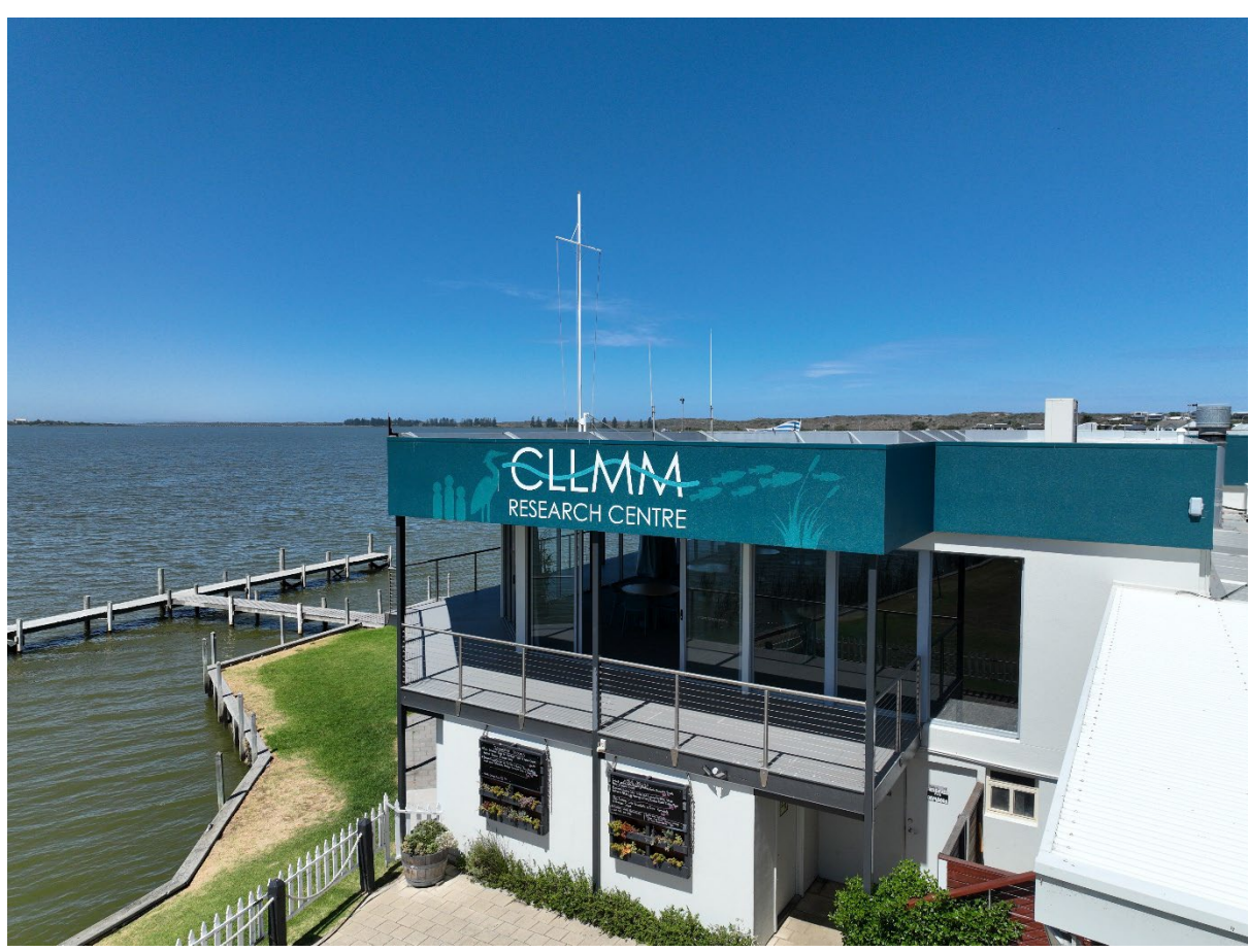
The Coorong, Lower Lakes and Murray Mouth Research Centre – Goolwa